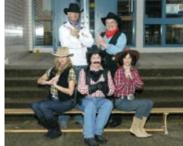
The staff at Moody Middle awaits.

"Schools and teachers must be challenged to use the tools and techniques of today, not the ones of the past. Learning in the 21st century requires critical thinking, adept use of technology, and global collaboration, and we should offer all these to our students on a regular basis. Let's make the best possible uses of the new tools available to us so that our students are better prepared to participate in the global community."